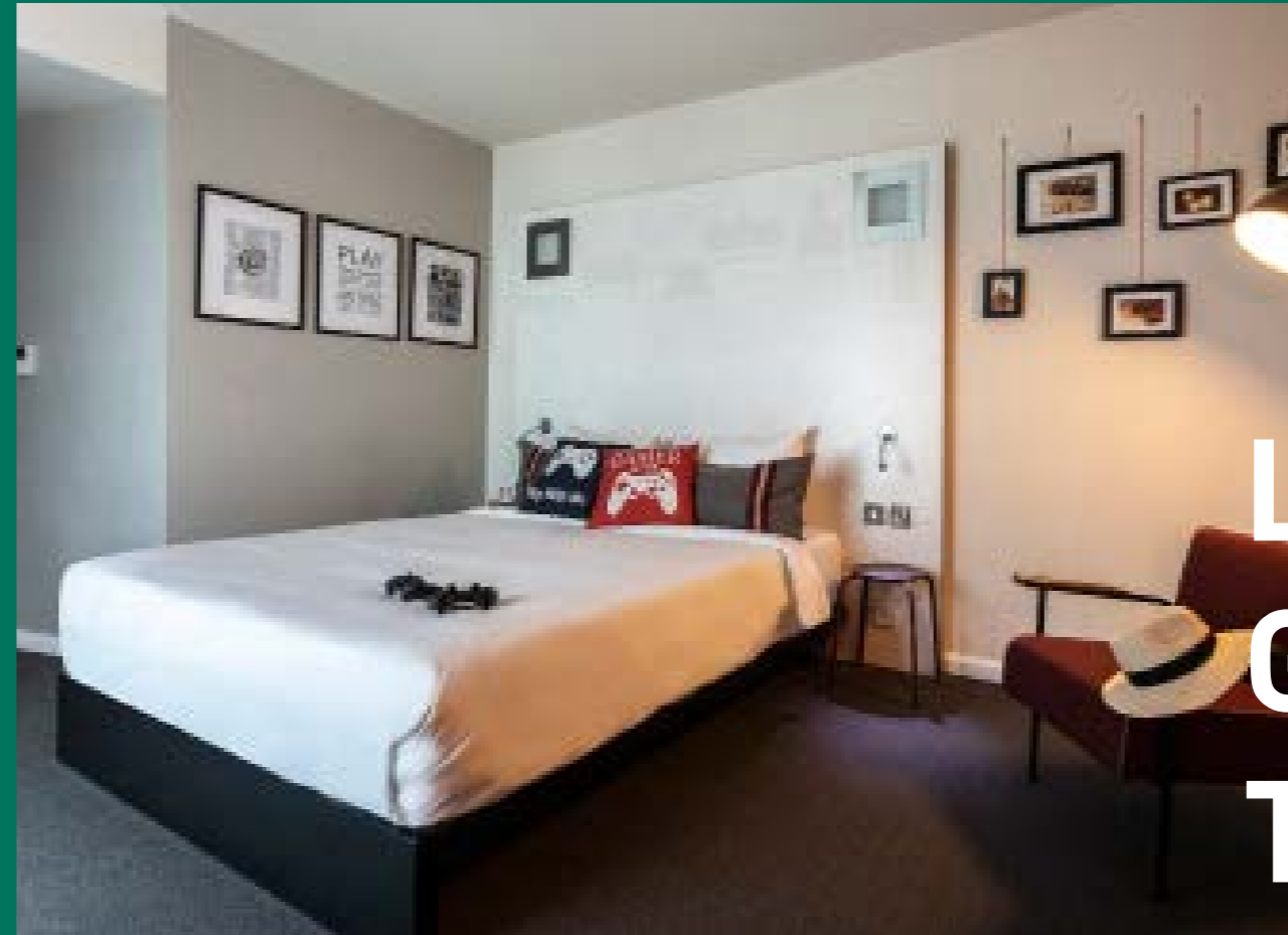
PENTA PLAYER ROOM