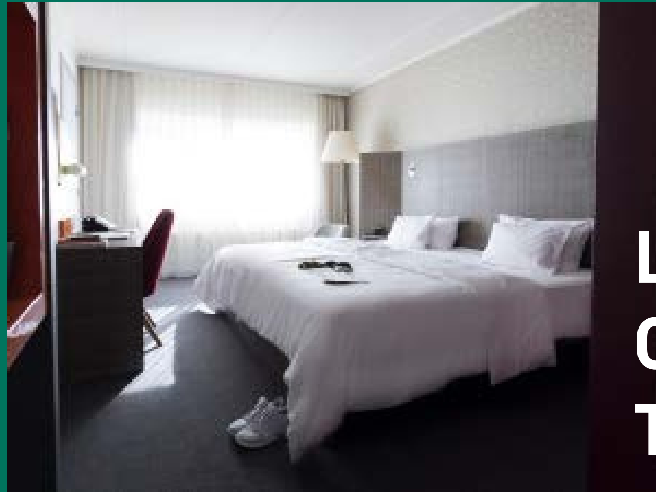
PENTA JUNIOR SUITE