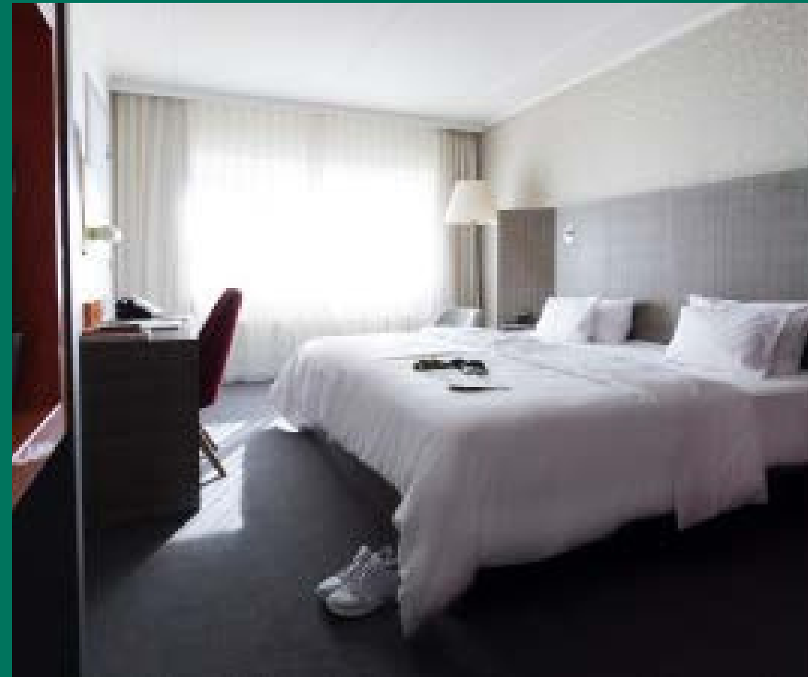
PENTA JUNIOR SUITE